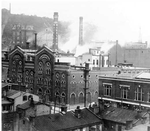
History of the area