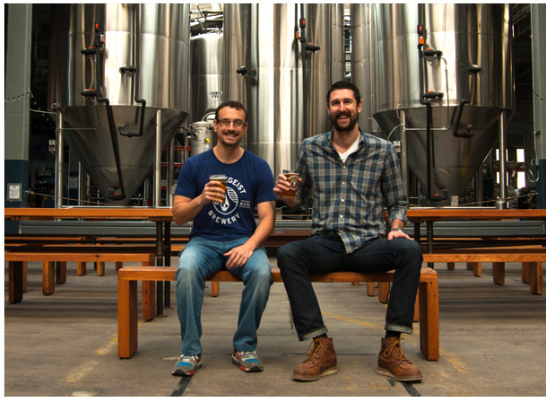
History and culture