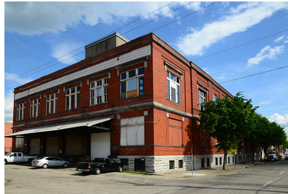
Infrastructure and zoning