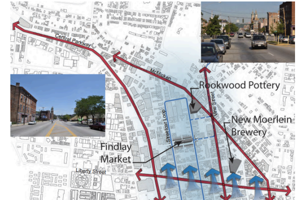
Benefits to location