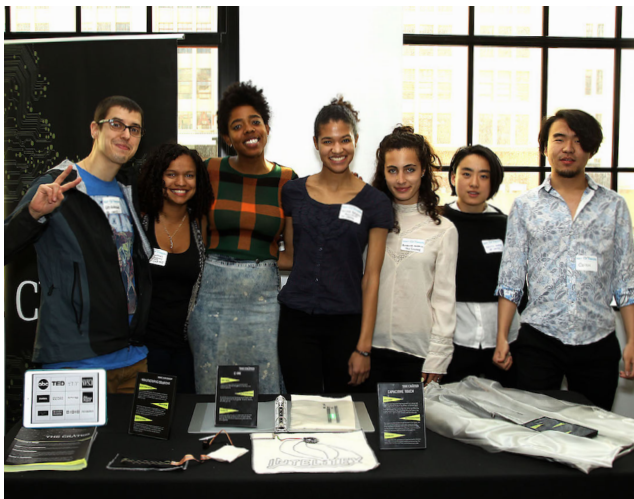
The team from The Crated, a 2015-16 Next Top Maker finalist, present some examples of their work at the Next Top Makers closing showcase. The team specializes in working with companies to integrate technology into textiles with a focus on design and supply chain integration.

Through their participation in the Equitable Innovation Economies Initiative (EIE) Pilot, NYCEDC has been able to develop indicators that track job opportunities for women and people of color within advanced manufacturing, as well as how awareness about employment and entrepreneurship opportunities circulates through the city's neighborhoods and affects participation within the field.