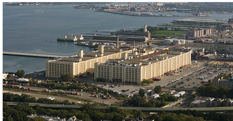
Built in 1919, Brooklyn Army Terminal in Sunset Park, Brooklyn is now home to over 100 companies in diverse industries such as bioscience, food, fashion and electronics.